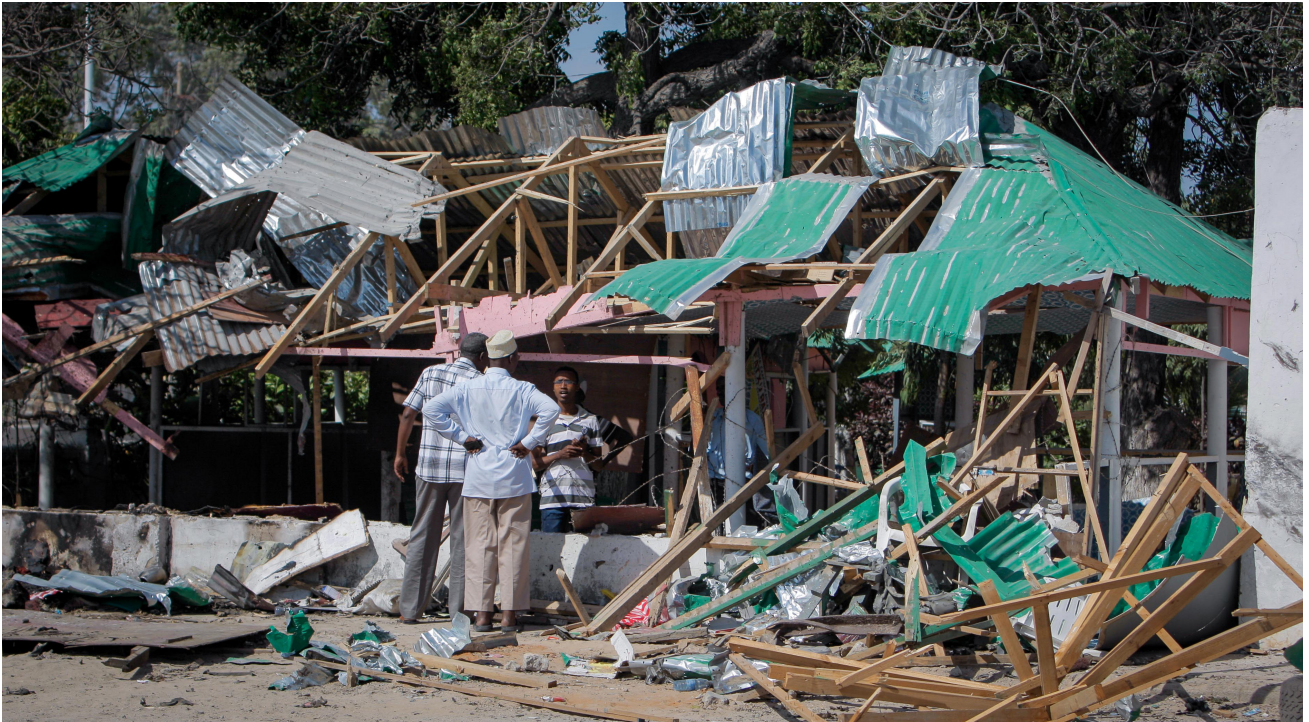
Workers clearing debris at the Village Restaurant after a double suicide attack by extremist group Al Shabaab in Mogadishu, Somalia. September 2013.

In the wake of the 9/11 attack, members of the international community responded in a heavy handed and militarized way to terrorism and adopted a counter terrorism (CT) approach. Yet, terrorist attacks and fatalities have dramatically increased and more powerful terrorist groups have been created. With the emergence of the prevention of violent extremism (PVE) approach, a greater emphasis is now given to so-called “soft” alternatives. However, the question remains whether it is a change in content or just a semantic shift.