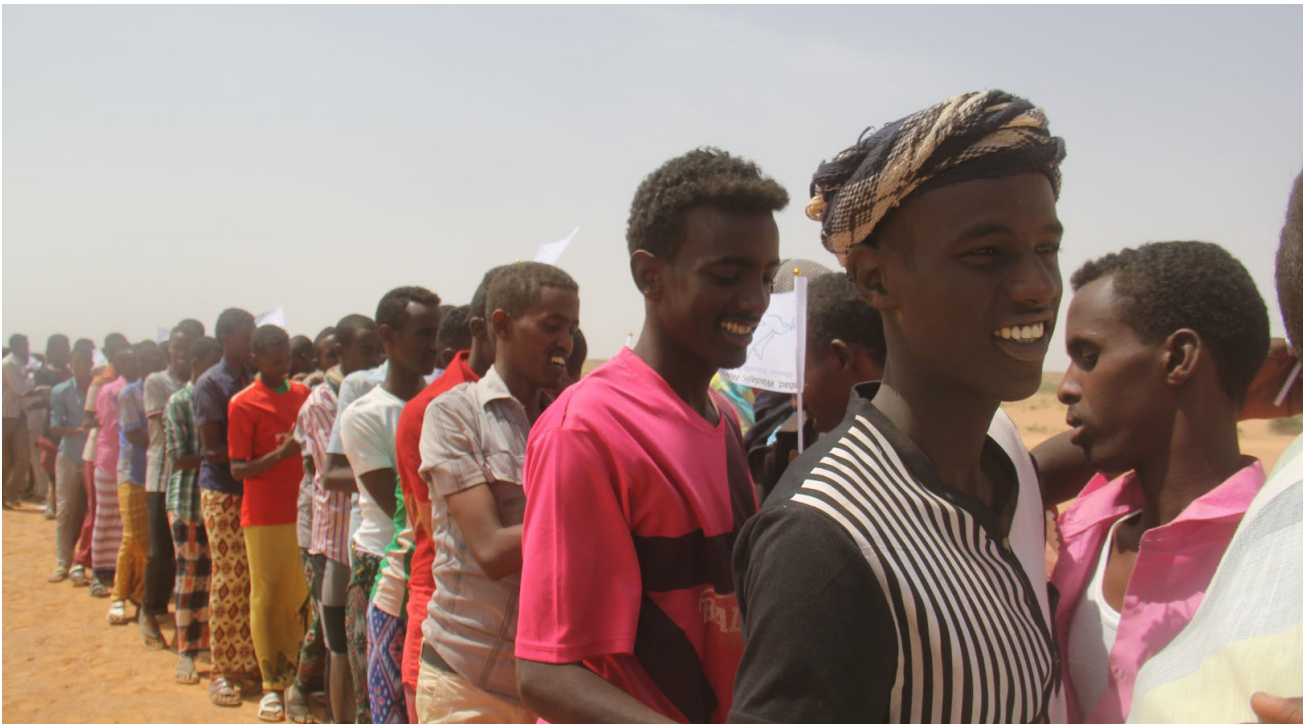
Youth of both clans take time for acquaintance in Somalia, 2015. Interpeace

Countering violent extremism (CVE) is a key priority for the international community. Traditional methods have sought to respond to these phenomena through a security framework, often leading to a military response to “counter” the threat posed by armed groups. However, this costly approach has yet to demonstrate its effectiveness, as it often increases rather than diffuses tension. From its experience working in 23 conflict zones worldwide, Interpeace has found that CVE strategies need to pay more attention to two key elements: