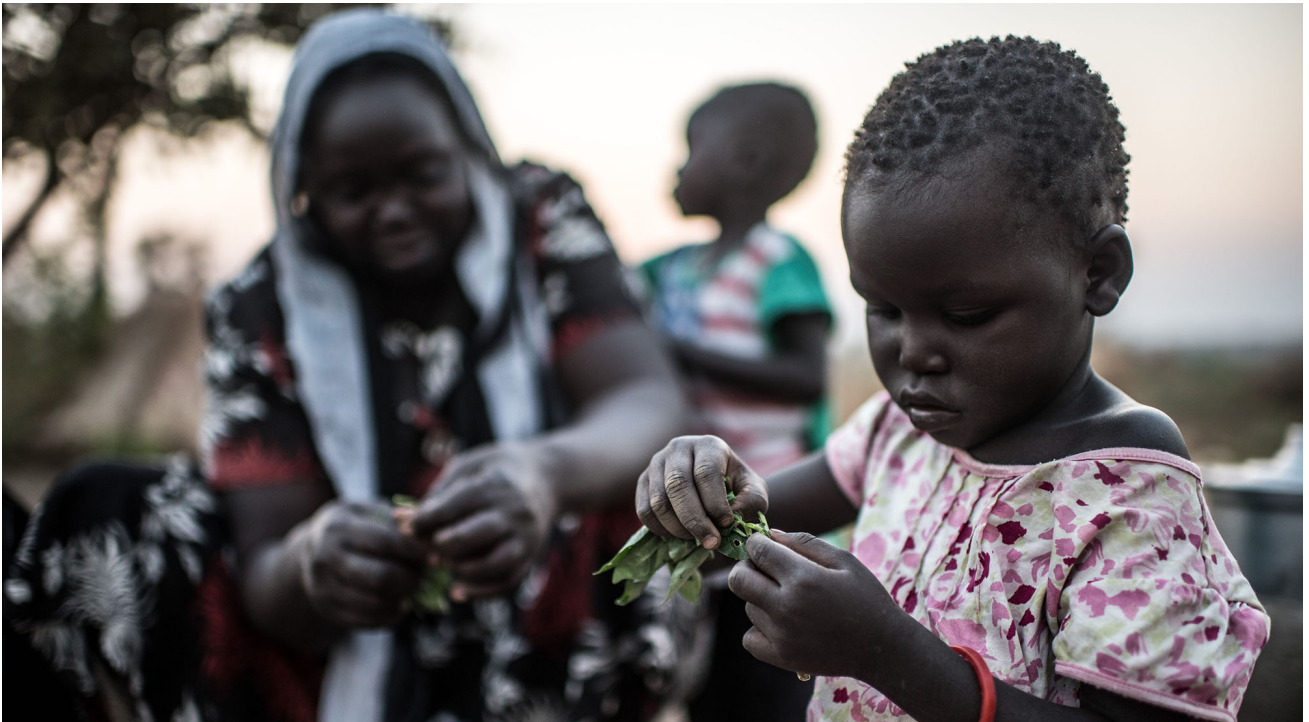
A South Sudanese mother and child harvesting greens

Recent warnings of a looming famine and catastrophic food insecurity have put the Horn of Africa into renewed focus of the international community. In South Sudan, UN organizations have already declared famine in several counties. They stressed that the continuous rise in food insecurity was largely ‘man made’, a consequence of the ongoing civil war in the country.