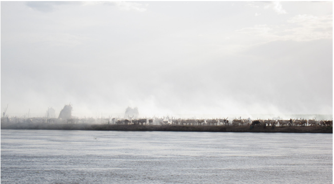
A cattle camp across the river Nile in Bor, South Sudan.

South Sudan has a long history of international engagement in humanitarian aid, development, peacebuilding and statebuilding. Following the outbreak of renewed conflict in December 2013, a number of donor countries (Switzerland, Canada and the UK) decided that it was important not to continue with a “business as usual” approach. They resolved that their operations in South Sudan should be conducted in a conflict sensitive manner and, where feasible, contribute towards sustainable peace. A consortium of three expert organizations (Saferworld – consortium lead agency; CDA Collaborative Learning Projects; swisspeace) was contracted to set up and manage a “Conflict Sensitivity Resource Facility” (CSRF) to be based in Juba.