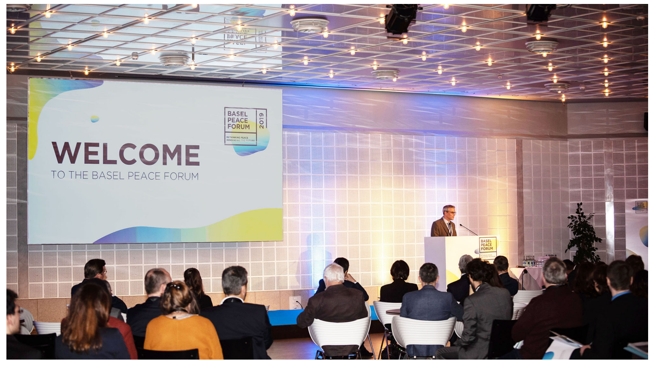
Welcome address to the Basel Peace Forum by swisspeace Director Laurent Goetschel.

Developing new and innovative approaches to peacebuilding is the stated aim of the Basel Peace Forum 2019. With this goal in mind, approximately 200 leading experts and decision-makers in the fields of politics, economics, civil society, and science got together in the Congress Center Basel and the Basel Art Museum on January 13 and 14. The forum, taking place for the third time, was organized by the Swiss peace foundation swisspeace, and supported by the Canton of Basel-City, the Swiss Federal Department of Foreign Affairs FDFA and private individuals.