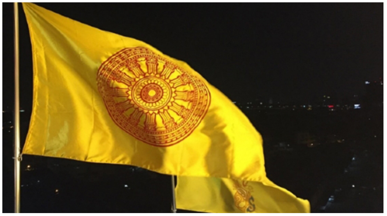
Dharmachakra flag on the Wa Saket Temple in Bangkok.

"Religion, Politics, Conflicts" is a department of the FDFA's Human Security Division. Its aim is to support Switzerland's action to promote peace in the interplay between religions, politics, and conflicts.