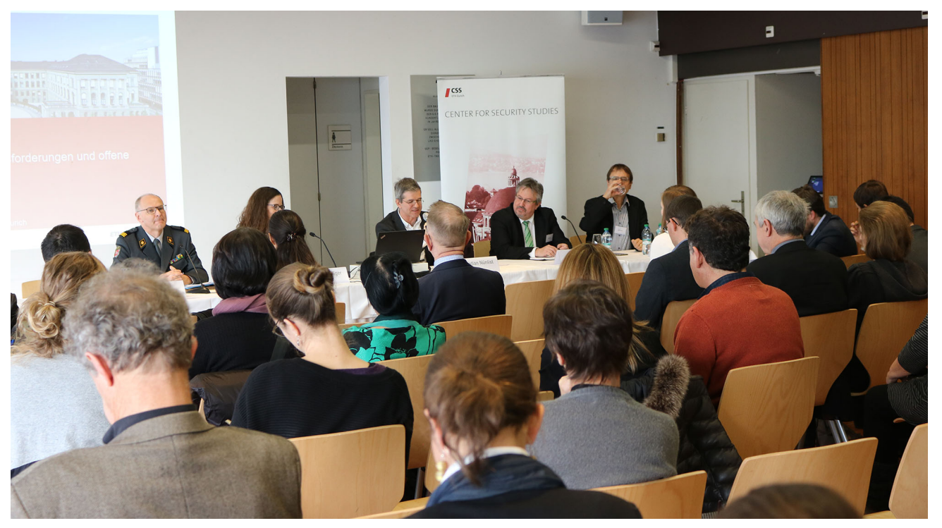
ETH Conference on Security Policy on January 25, 2019 in Zurich.

On January 25, the 31st ETH Conference on Security Policy addressed the following questions: How do Swiss actors handle the issue of religion in conflicts? What challenges does this issue pose, both now and in the future? The participants included representatives from the public and humanitarian sectors, politics, the military, and civil society. The topics discussed at the conference ranged from the Swiss Wars of Kappel of the 16th century, mediation projects in southern Thailand and Kyrgyzstan and global trends in conflict and peace issues through to Islam in Swiss society. The following main findings emerged: