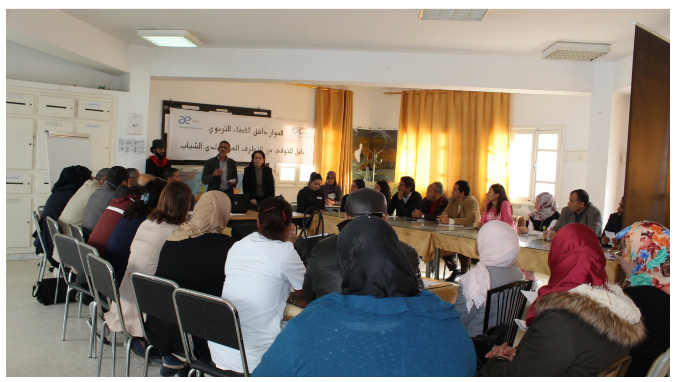
Discussion group in Sidi Hassine.

Tunisia has a large number of young people and teens. Their prospects in the wake of the revolution have not improved. Far from it: the vast majority of people we speak to in Tunisia consider the economic, and often political, situation to be worse than before 2011. Young people are at risk and can easily give in to the temptations offered by extremist recruiters, who promise them not only a better future but also, and possibly most of all, the chance to take part in achieving a grand and noble cause and the opportunity to realize themselves through a truly cosmic project.