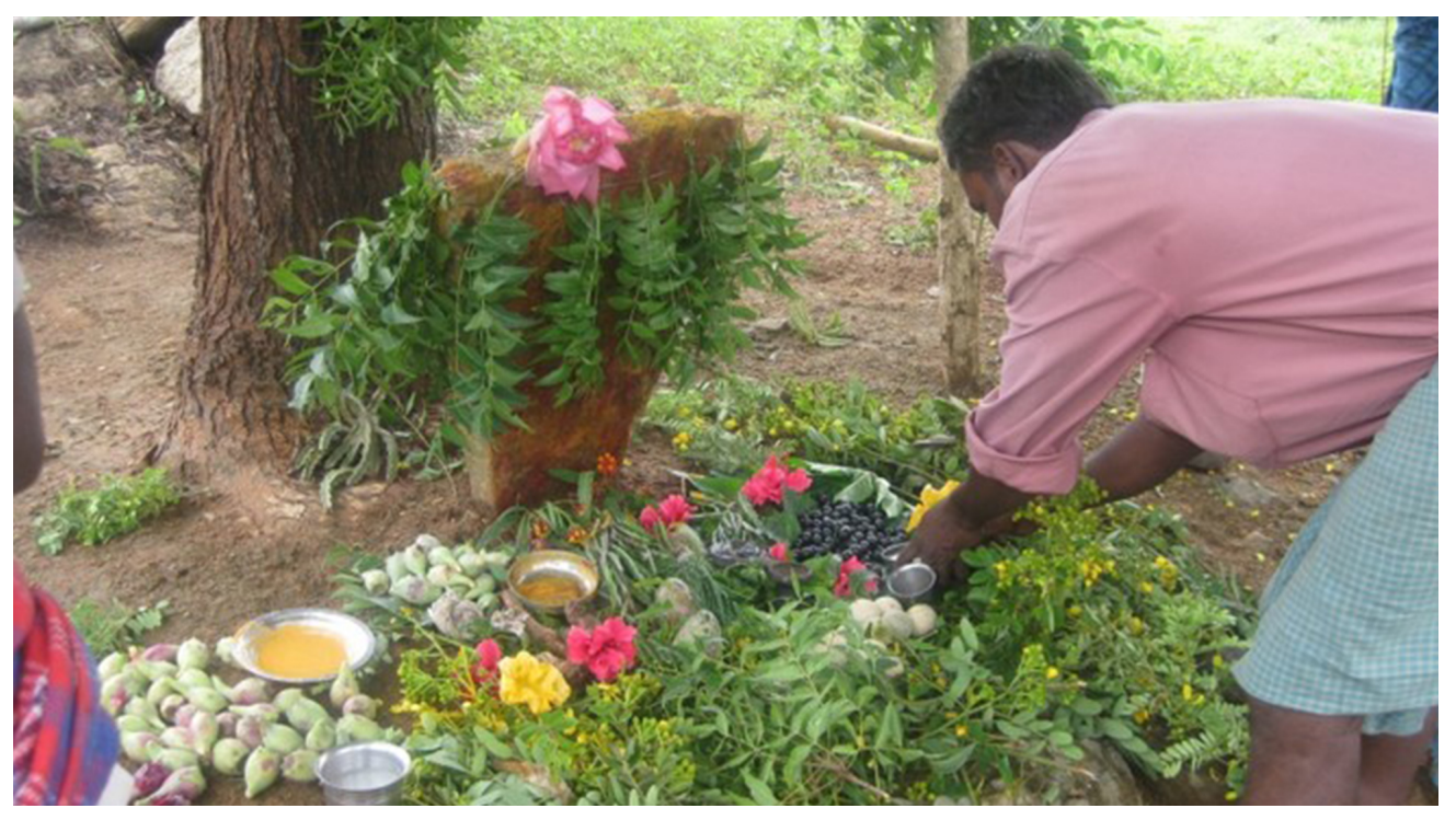
Animist temple built by the Adivasi in honor of their god of nature in Andhra Pradesh.

As a Catholic organization, the Swiss Catholic Lenten Fund (Fastenopfer) is aware of the importance of religion and spirituality in the specific context of each country, each culture, each universe of belief.