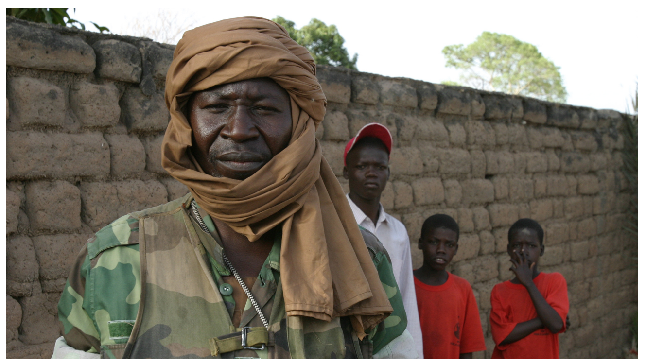
Rebel in the Northern Central African Republic.

The popular story goes that the conflict in the Central African Republic (CAR) is as simple as Muslim versus Christian; Séléka versus anti-balaka. This dominant narrative often leads to equally simplistic peacebuilding responses. By presenting this as a religious war and ignoring the complexities, the real drivers of conflict will never be tackled.