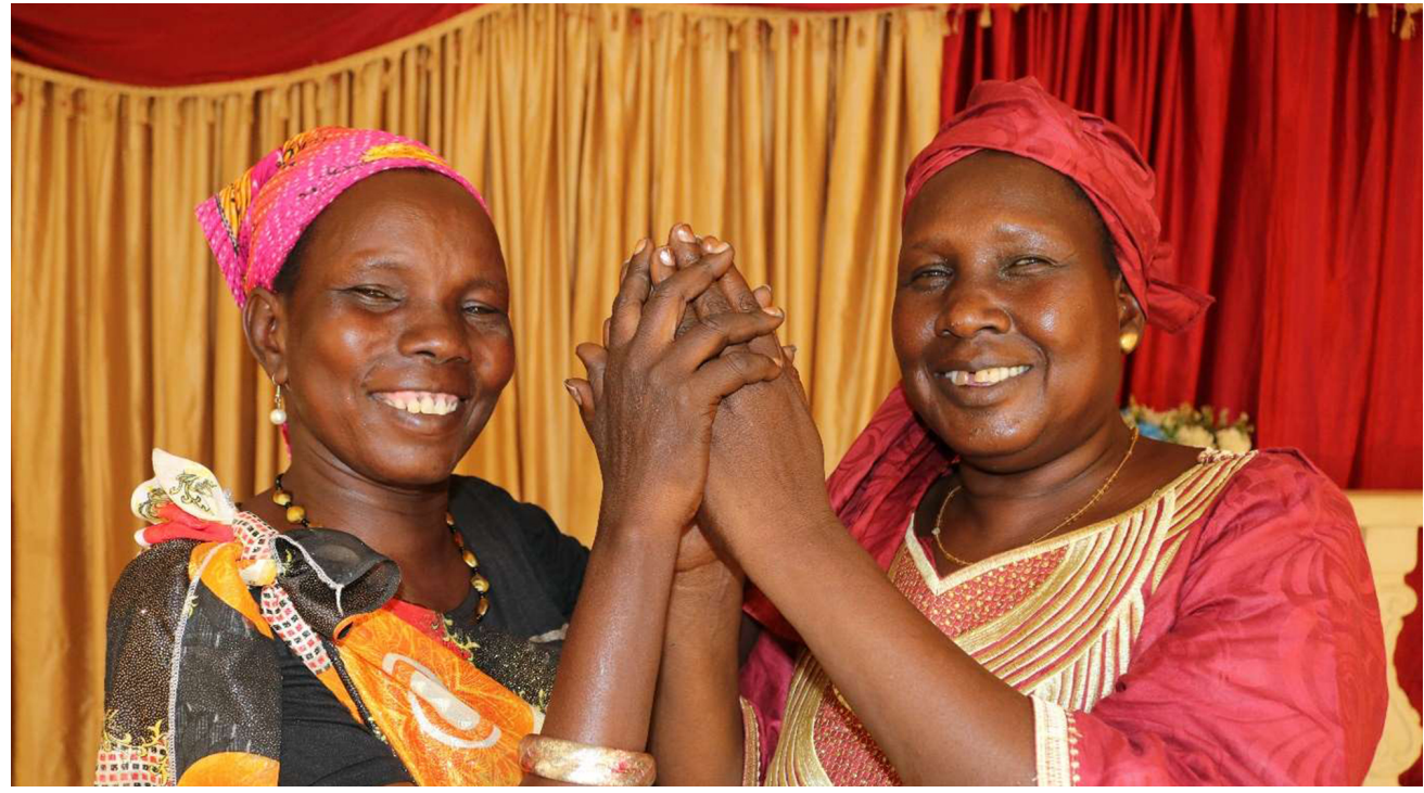
A Nuer and a Dinka working together for peace, South Sudan.

Are religions a curse in the peacebuilding process as they can fuel conflicts, or a blessing in that they give rise to peacemakers thanks to ethics which promote living and peace? Organizations with a religious background working in international cooperation are given a hard time by a considerable proportion of Swiss society. This can be put down to images in the media, among other things. We hear more about extremist Muslims and the cases of abuse in the Catholic Church than the potential of religions as forces to bring about change in society, for example. What's more, there is a growth paradigm in development policy, which has long been dominated by economic and technical factors and has ignored religious and cultural ones.