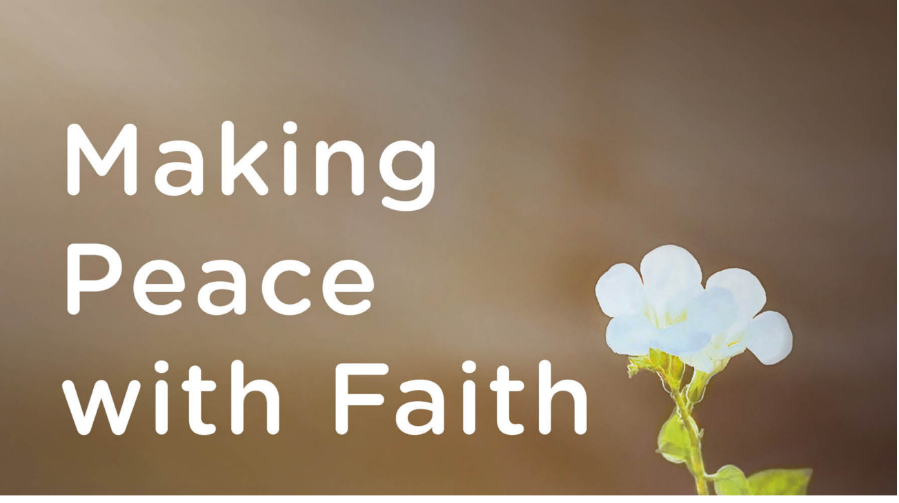
Book-Cover: Making Peace with Faith: The Challenges of Religion and Peacebuilding

Context analyses and peacebuilding evaluations provide me with opportunities to observe the interplay of religion and conflict around the world. I also experience those dynamics as a faith-motivated practitioner based in the troubled United States. Religion is almost never a primary driver of conflict, but often an important secondary factor as a source of identity, a shaper of mindsets or an influential institution. The issue of religion as an identity marker is worth exploring, because it often confuses peace practitioners.