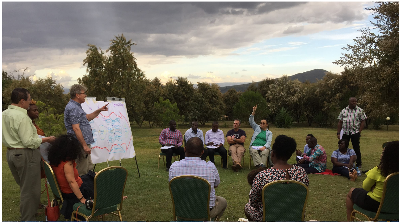
Session on change processes during the 2018 regional edition of the course in Naivasha, Kenya.

National and international experts/advisers are often mandated to provide assistance on policy formulation and implementation in countries emerging from dynamics of violence. However, reviews of decades of technical assistance make evident that the expertise provided is not always producing the desired results, nor contributing to sustaining peace. This is partly due to a focus on the production of tangible deliverables – such as laws, infrastructures, policies or plans – with little attention to longer-term governance processes and the development of local capacities.